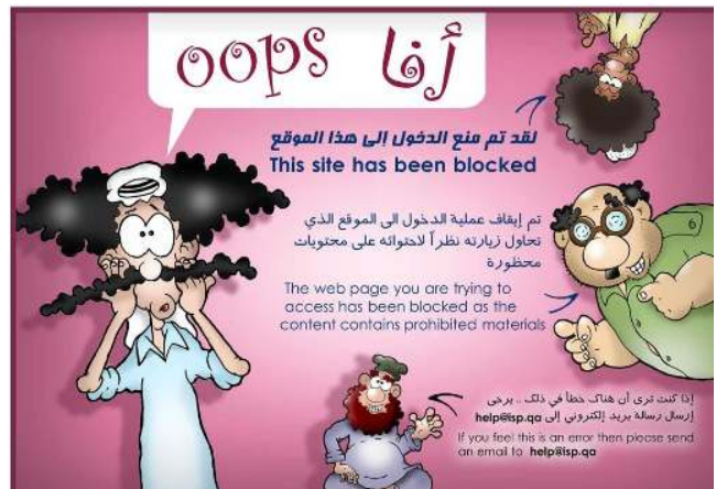
Figure 3: Example block page from Qatar.