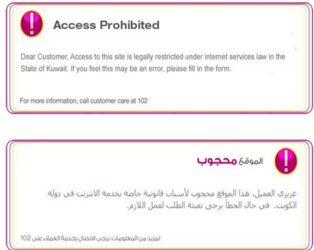
Figure 2: Example block page from Kuwait.